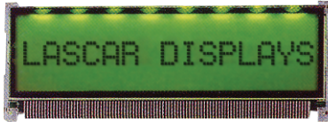
1 x 16 Character Display

Today, Lascar Electronics offers a complete range of standard and custom graphic & character modules. With Lascar's vertically integrated manufacturing ability and partnerships, including custom design, service assembly, COB, COG, TAB, touch screen & packaging, projects can easily and efficiently be addressed for a number of custom designs.